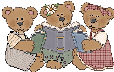
Bear buddies read together

Beginning at a willing age, usually around 2, I offer a preschool program. There is no additional cost for this program. I am currently using the program entitled, "FunShine Express". Take a moment to view this program online at www.funshineexpress.com . We use the program 3 days per week. We really enjoy the program because it is flexible, fun, educational, and it allows us time to enjoy other activities too. There is also a parent's letter that is sent home with you each week, which includes some of the songs, books, etc. so you can participate along with us at home! The preschool program runs September through May. The summer months are packed full of fun and stimulating outdoor activities with story time and other activities included.